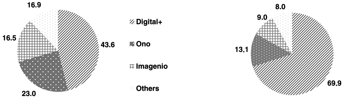
Detail of total revenue for 2009 (%)